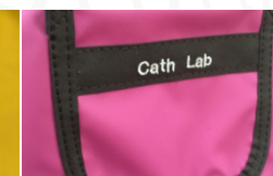
Pocket with Embroidery