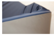
GRIP LOCK Base