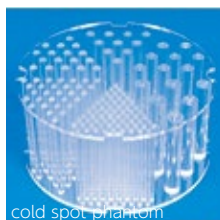
cold spot phantom