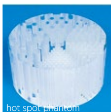
hot spot phantom