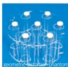
geometric distortion phantom