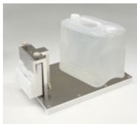
Optional parts: holder