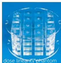
dose linearity phantom